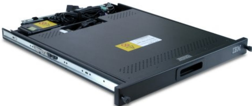
Figure 3. IBM 1U 19-inch Flat Panel Console Kit

Figure 3 shows the IBM 1U 19-inch Flat Panel Console Kit in the closed position.