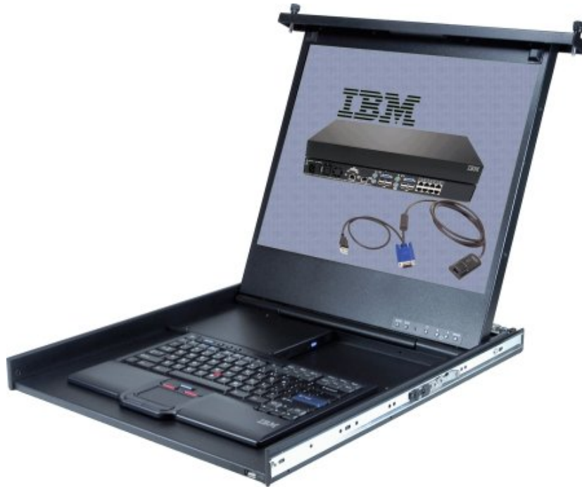
Figure 1. IBM 1U 19-inch Flat Panel Console Kit with the IBM UltraNav USB US English keyboard

These kits include either a 17" or 19" LCD display and accept an UltraNav keyboard available in 29 languages (the keyboard must be ordered separately). The 19-inch kit also includes as standard a multi-burner drive and USB port for additional convenience.