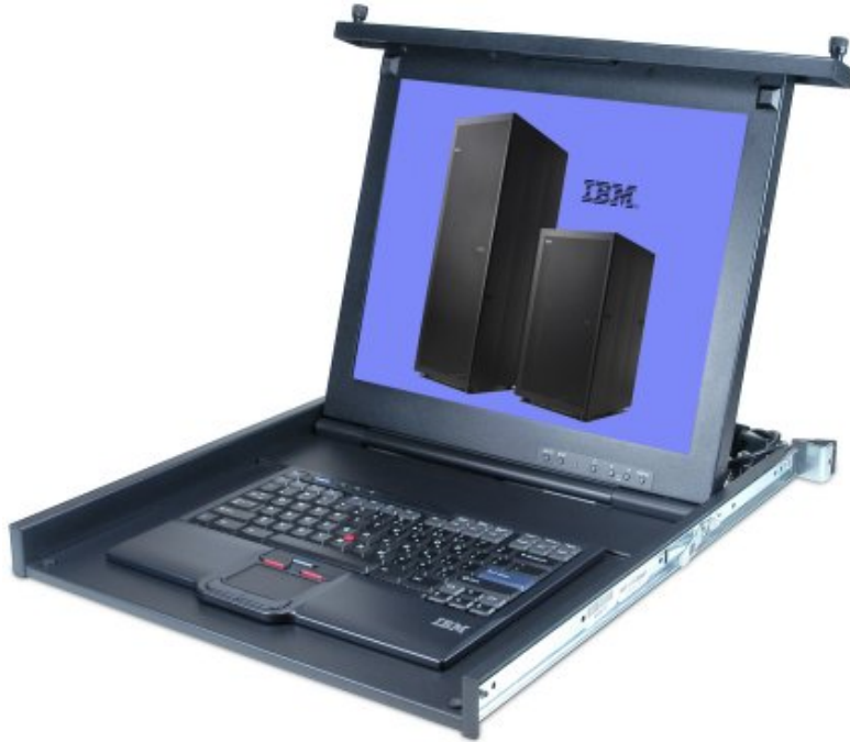
Figure 2. IBM 1U 17-inch Flat Panel Console Kit with the IBM UltraNav USB US English keyboard

Note: The console kits do not include a keyboard. See Table 2 for the supported USB keyboards and Table 3 for the supported PS/2 keyboards.